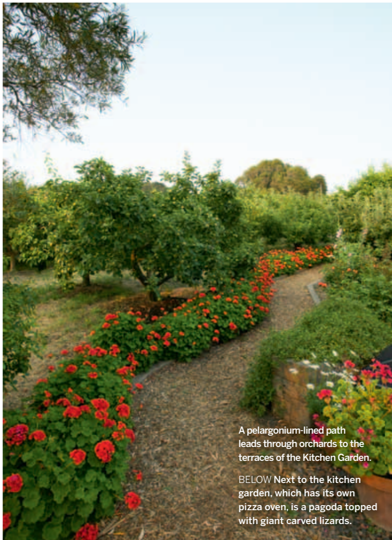
A pelargonium-lined path leads through orchards to the terraces of the Kitchen Garden.

BELOW Next to the kitchen garden, which has its own pizza oven, is a pagoda topped with giant carved lizards.